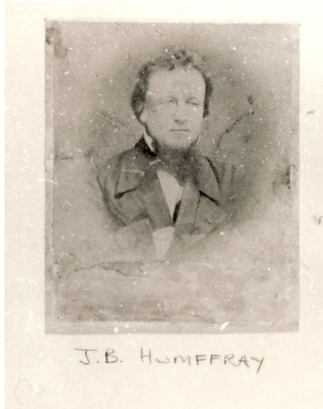
John Basson Humffray

John Basson Humffray was born in Newtown, Wales, in 1824. After a good education, he was articled to a solicitor, but abandoned his studies and went to the Victorian goldfields. He arrived at Melbourne aboard the Star of the East on 19 September 1853.